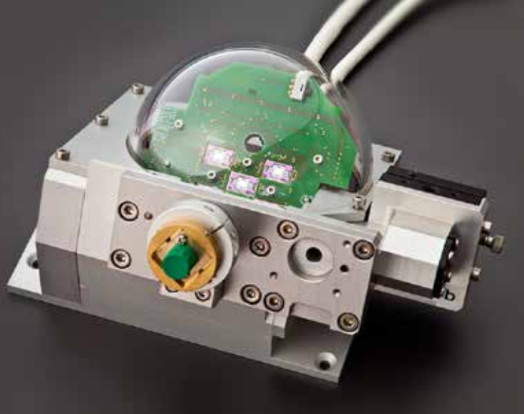
Optical scan head of a 3D-TOF camera with integrated MEMS scanning mirror array.